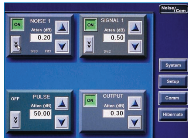
Intuitive standard control menu